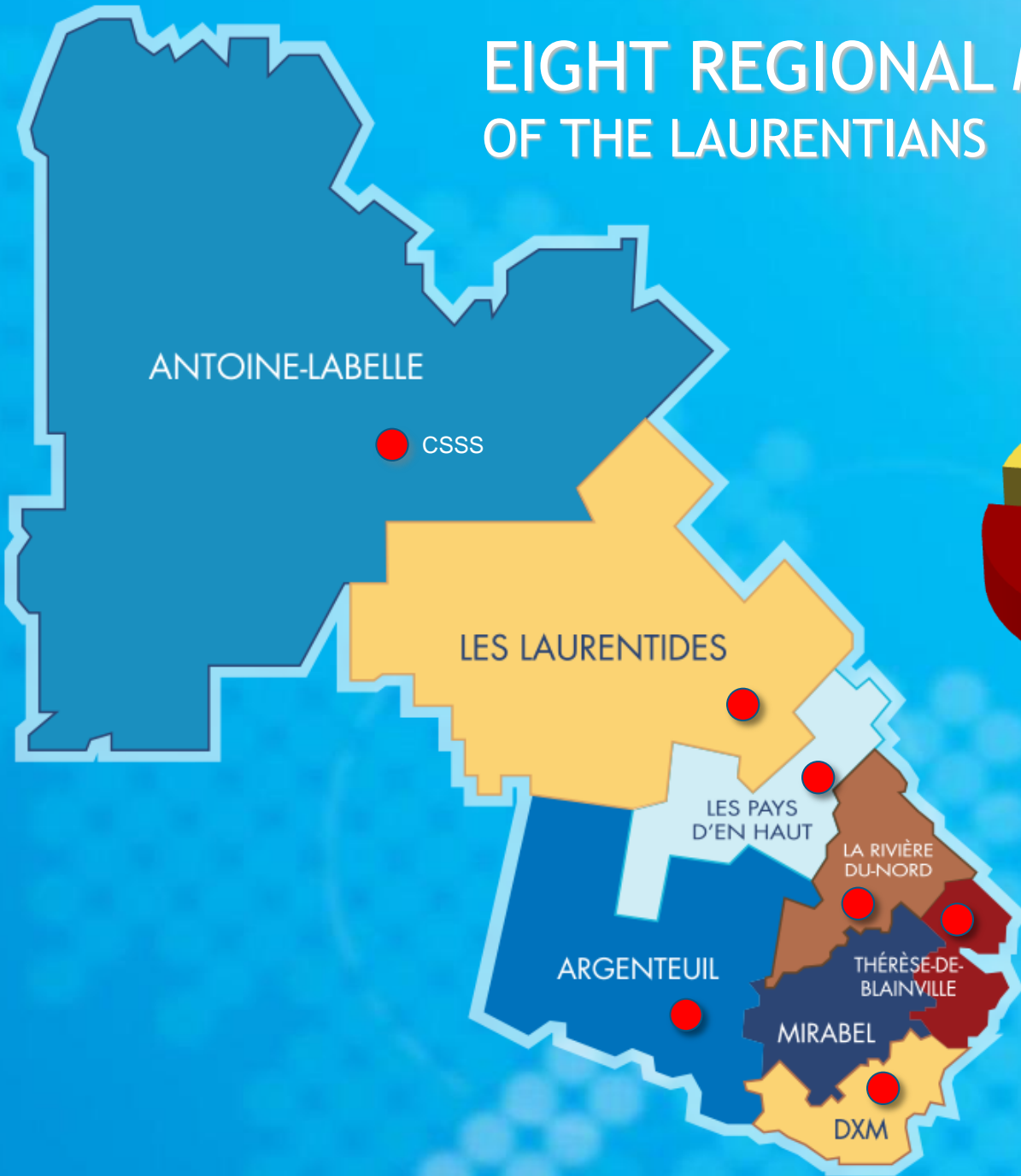
Percentage of Anglophones by CSSS Territory